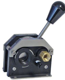
Reinforced Molded Body with Stainless Disc