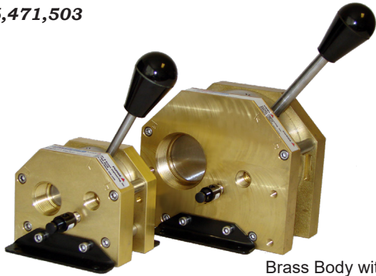
Brass Body with Stainless Disc